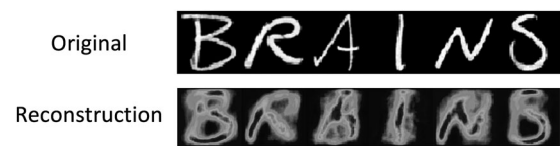
Figure 2. Neural reconstruction of perceived stimuli. Schoenmakers et al. (2013) showed individuals various letters and used the neural response in the visual cortex to decode and reconstruct the originally perceived letters.

Appraisals ought to be studied the same way. As a neuroscientist, the approach I am taking is to