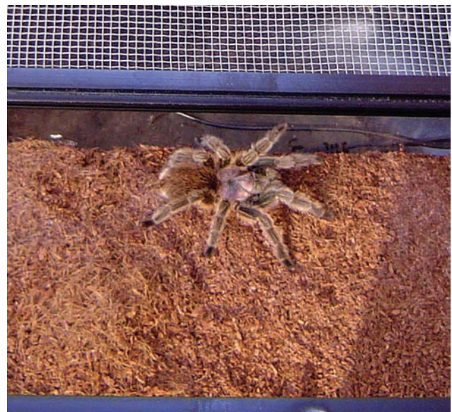
Fig. 1. Spider and container used in the pretest, immediate posttest, and 1-week posttest.

Participants in the affect-labeling group were instructed to create and speak a sentence including a negative word to describe the spider and a negative word or two to describe their emotional response to the spider (e.g., "I feel anxious the disgusting tarantula will jump on me"). In the reappraisal group, participants were instructed to create and speak a sentence including a neutral word to describe the spider and a neutral word or two to describe a way of thinking about the